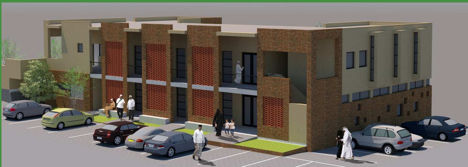
VIEW FROM MASJID REAR PARKING LOT