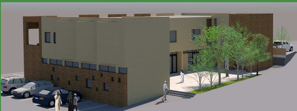
VIEW FROM FIONA CRESCENT