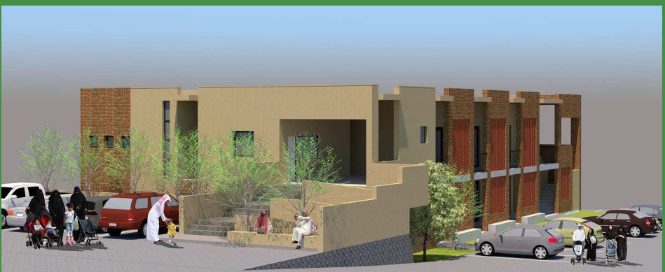
MAIN ENTRANCE VIEW FROM MASJID PARKING LOT